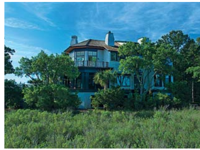
29 Marsh Edge Lane* $2,395,000 5 BR, 5 and 1/2 BA Marsh View