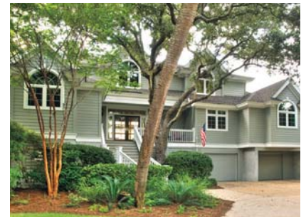
32 Marsh Edge Lane* $1,750,000 4 BR, 3 and 1/2 BA Marsh View