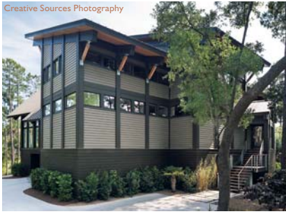
102 Blue Heron Pond* $2,795,000 4 BR, 3 and 1/2 BA Lagoon View