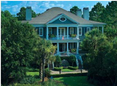
155 Flyway Drive* $4,200,000 5 BR, 5 and 1/2 BA Fairway/Lagoon View