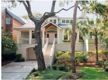
87 Surfscoter Lane $1,299,000 4 BR, 4 BA Lagoon View