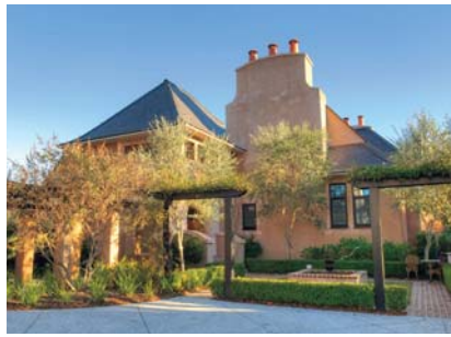
241 Beauty Berry Lane* $2,575,000 4 BR, 4 and 1/2 BA Lagoon View