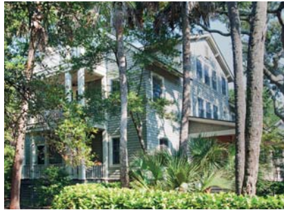
38 Eugenia Avenue* $2,950,000 6 BR, 7 and 1/2 BA Woods View