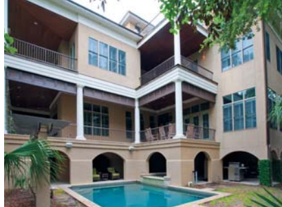
413 Ocean Oaks Court* $3,500,000 F 5 BR, 5 and 1/2 BA Lagoon View