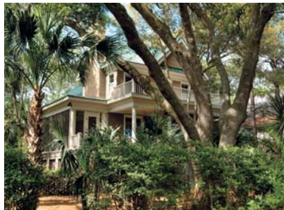
49 Cotton Hall* $1,275,000 4 BR, 4 BA Fairway View