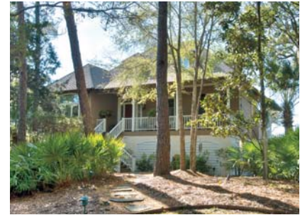
65 Persimmon Court* $1,445,500 3 BR, 3 and 1/2 BA Marsh/River View