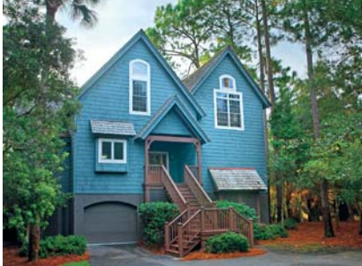
30 Marsh Cottage Lane* $1,100,000 F 4 BR, 4 and 1/2 BA Marsh View