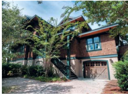
800 Osprey Cottage* $2,695,000 F 5 BR, 6 BA Fairway/Lagoon View