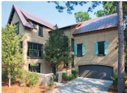
5517 Cypress Cottage Lane 4 BR, 4 and 1/2 BA Lagoon/Golf View