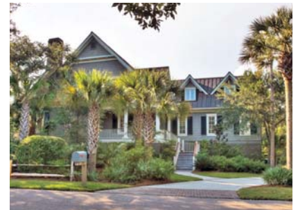
101 Blue Heron Pond* $2,150,000 F 5 BR, 5 and 1/2 BA Marsh/Lagoon View