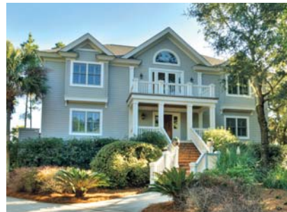
427 Snowy Egret Lane* $1,595,000 4 BR, 3 Full and 2 Half BA Marsh View