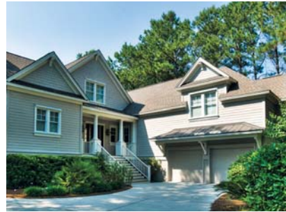
223 Fish Hawk Lane $1,350,000 F 6 BR, 4 and 1/2 BA Woods View