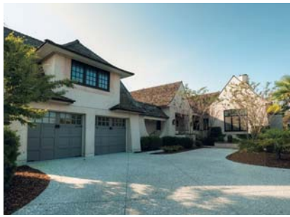
250 Grass Garden Lane* $1,997,000 3 BR, 3 and 1/2 BA Woods View